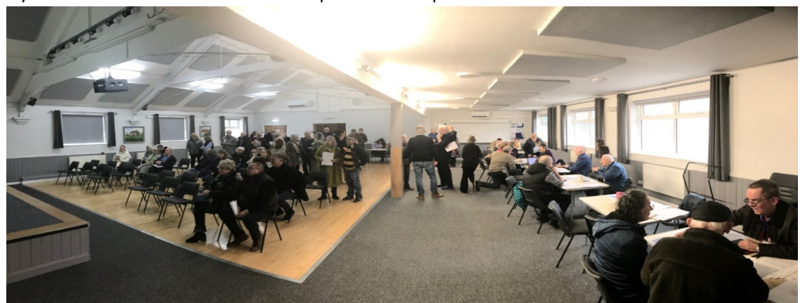
Parish Council Surgery . Village Hall Feb 2024 (quarry consultations).

We now await the outcome of the consultation. Alresford Parish Council is firmly against Church Farm field and Lodge Farm field being considered as suitable sites for quarrying, the reasons for objection are numerous, proximity to homes and schools, loss of amenity, transport issues, wildlife implications, archaeology, and effects on watercourses. We have a recently opened quarry at Sunnymede and we feel the cumulative impact of more quarries is unsustainable.